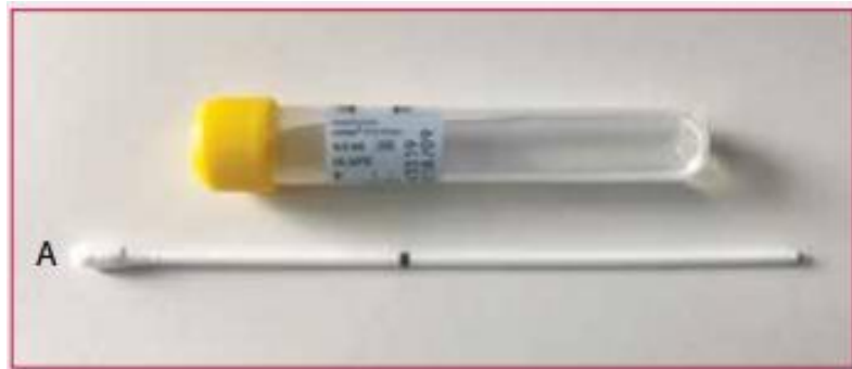
PCR set (yellow transport tube)